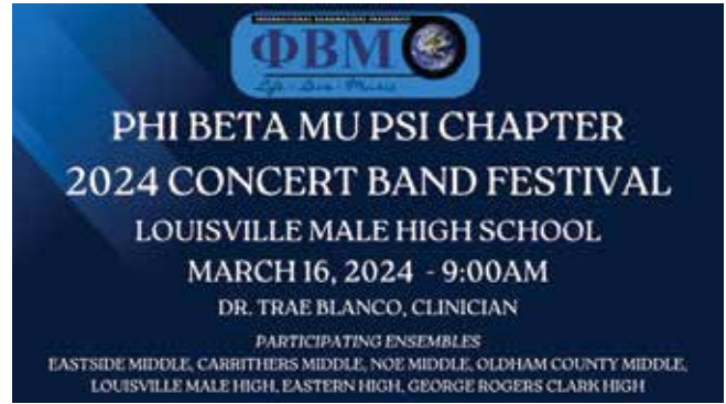
Social media post for the Psi Chapter Festival